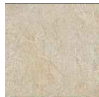
B & C